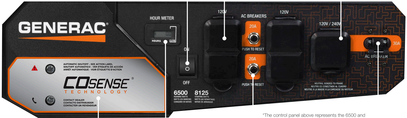
*The control panel above represents the 6500 and 8000W configurations