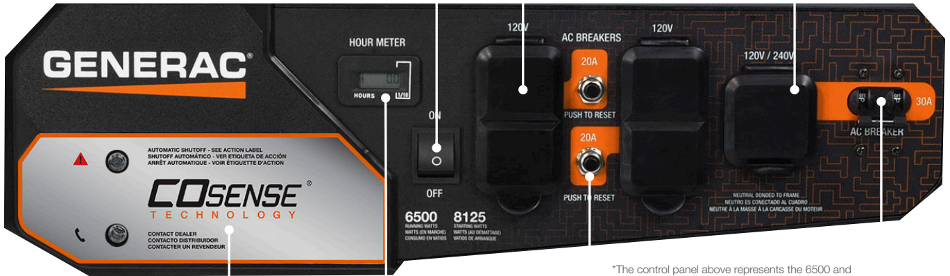
*The control panel above represents the 6500 and 8000W configurations