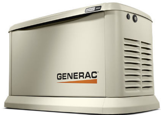
Product shown with optional fascia kit